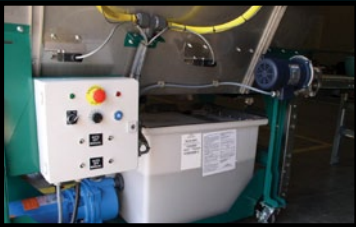
Recirculation Tank with multiple drain screens