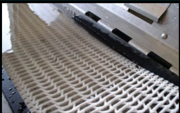
Optional "dip" for submerged and semi submerged watering