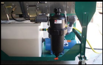
In-line filtration system to decontaminate water prior to product watering