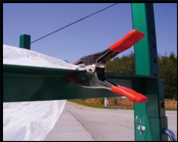
Bag Holding clamps