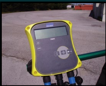
Weight scale screen