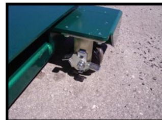
Casters for portability