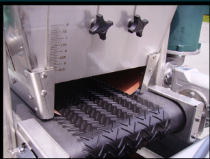
Etched gate setting for single speed unit