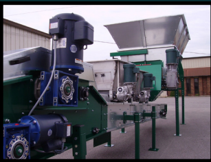
Chemical and fertilizer hopper