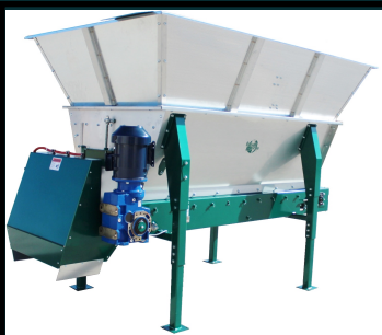
4 Cubic Yard Hopper