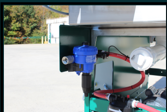
Injector & mix unit for sterilization