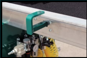
Guide rail adjustment