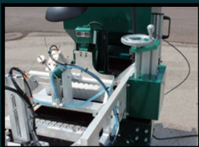
Single crank adjustment