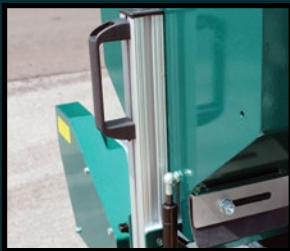
Easy-lift covering hopper