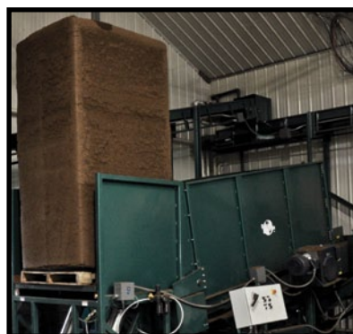
Optional Tip Table