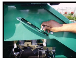
Adjustable soil gate

Variable seed soil 10" tires Vibration for plug trays