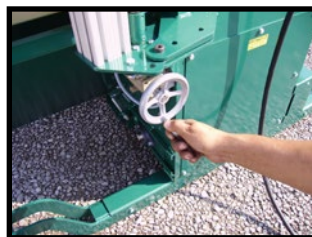
Quick & easy adjustments