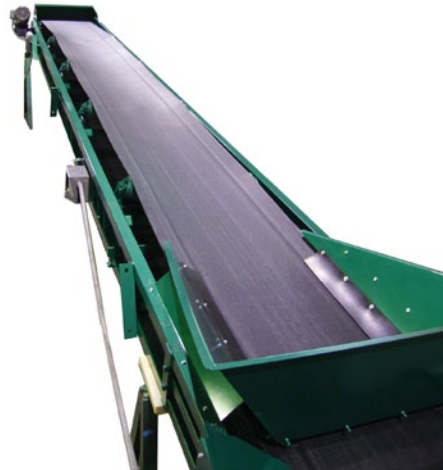
Model # 143

Incline Conveyors are used to transfer media to designated locations. Uses include feeding raw material into batch mixers, continuous soil mixing lines, potting equipment or flat filling equipment.