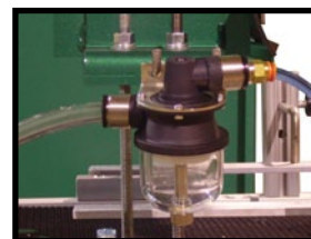
Vacuum seed recovery unit