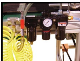
Air regulator and water separation

Linear action seeding increases accuracy, with an adjustable vibrator, vacuum controls, and large capacity top coating unit for uniform covering of finished trays. PLC controls allow quick and easy change-overs. Eight sets of various sized needles are included to accommodate multiple seed sizes.