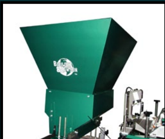
Large capacity covering hopper