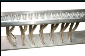
Multi - row drop tube