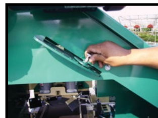
Adjustable soil gate

Variable seed soil 10" tires Vibraton for plug trays