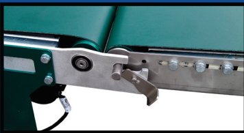
Conveyor to conveyor interlocking system