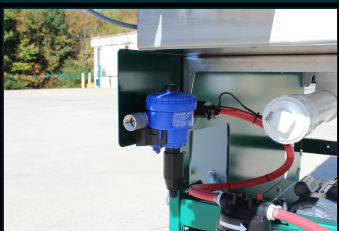
Injector & mix unit for sterilization